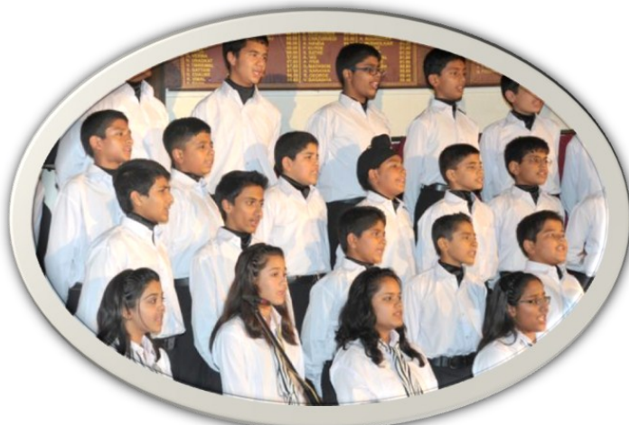
THE FANTASTIC CHOIR