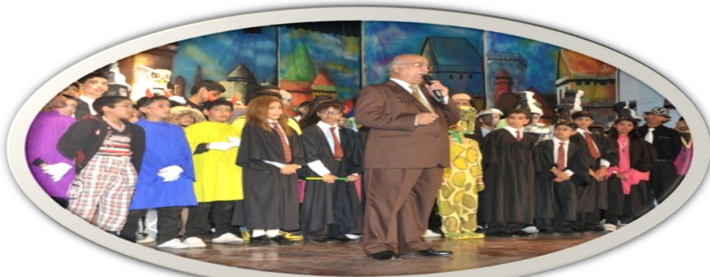
WORDS OF PRAISE AND ENCOURAGEMENT