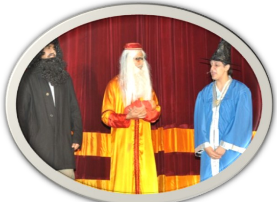
DUMBLE DORE AND PROFESSOR MCGONNAGAL