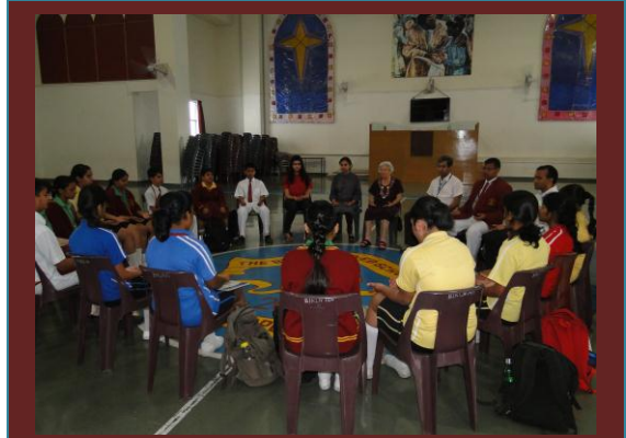
A SESSION IN PROGRESS