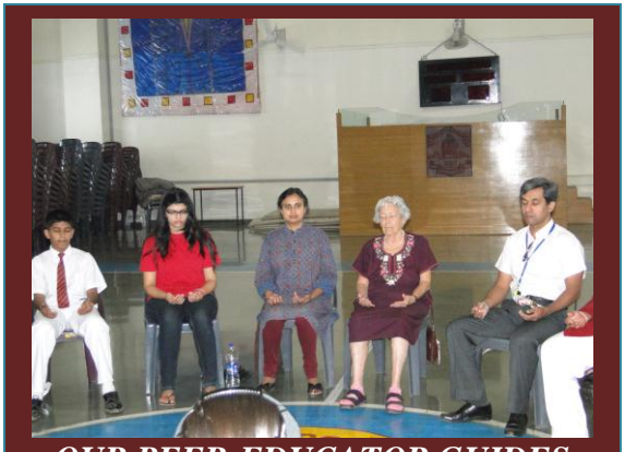
OUR PEER-EDUCATOR GUIDES