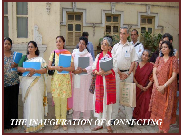
THE INAUGURATION OF CONNECTING