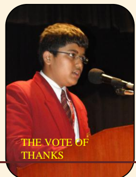
THE VOTE OF THANKS