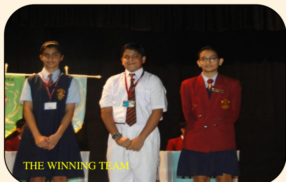
THE WINNING TEAM