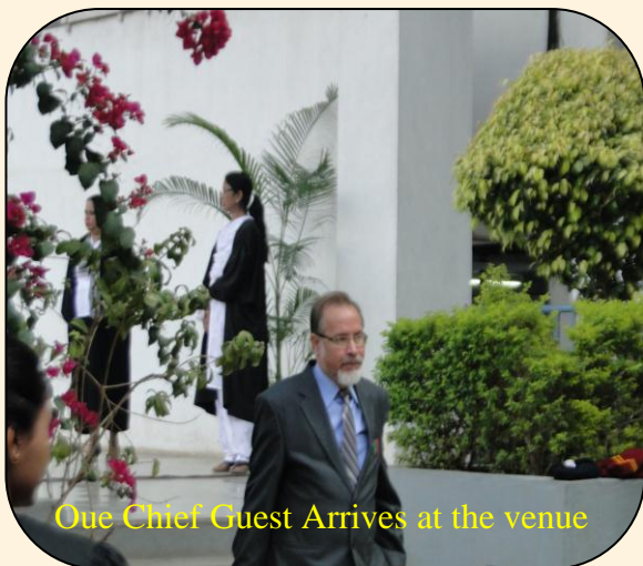
Our Chief Guest Arrives at the venue