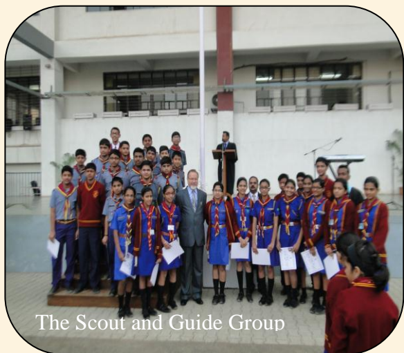
The Scout and Guide Group