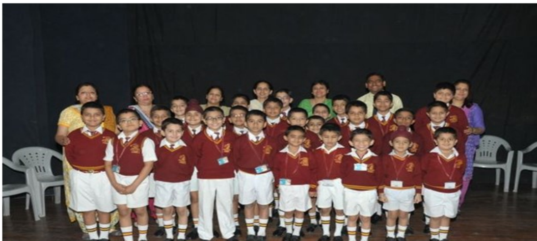
THE PARTICIPANTS-CLASSES 1 TO 5