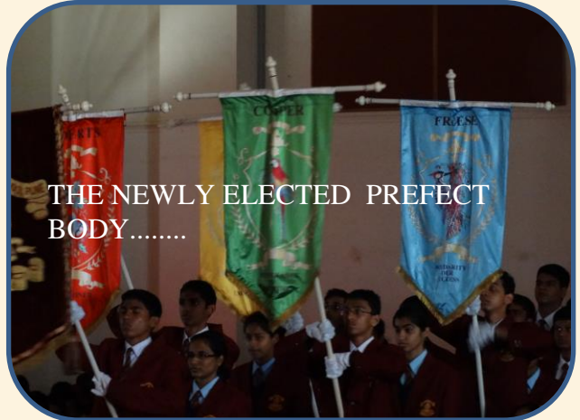
THE NEWLY ELECTED PREFECT BODY.....