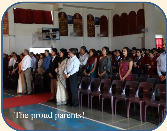
The proud parents!