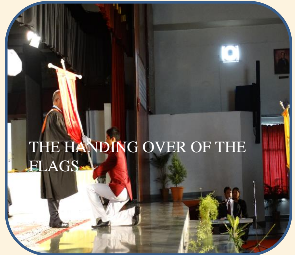
THE HANDING OVER OF THE FLAGS