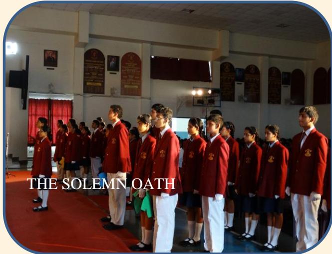
THE SOLEMN OATH