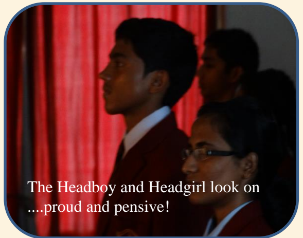
The Headboy and Headgirl look on ....proud and pensive!

LOOKING FORWARD TO AN EXCITING YEAR AHEAD!!!!