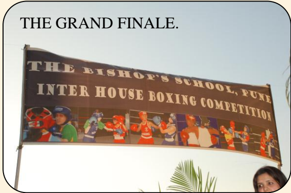
THE GRAND FINALE.