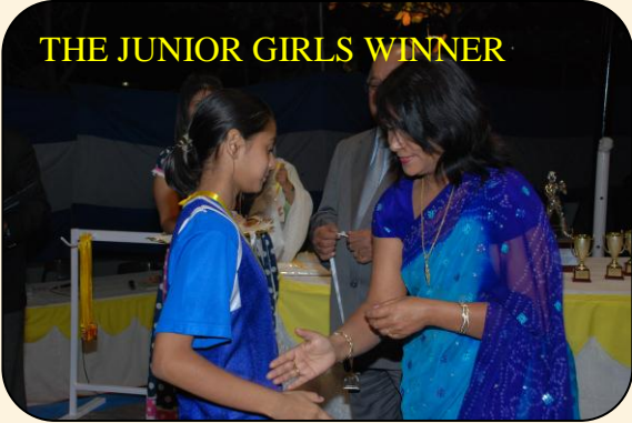
THE JUNIOR GIRLS WINNER