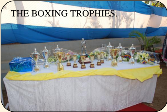
THE BOXING TROPHIES.