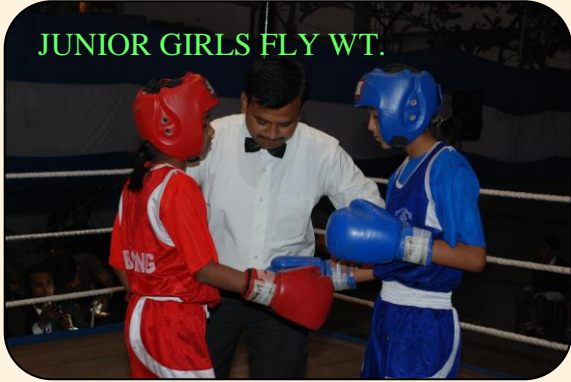
JUNIOR GIRLS FLY WT.