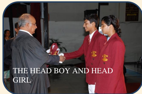
THE HEAD BOY AND HEAD GIRL