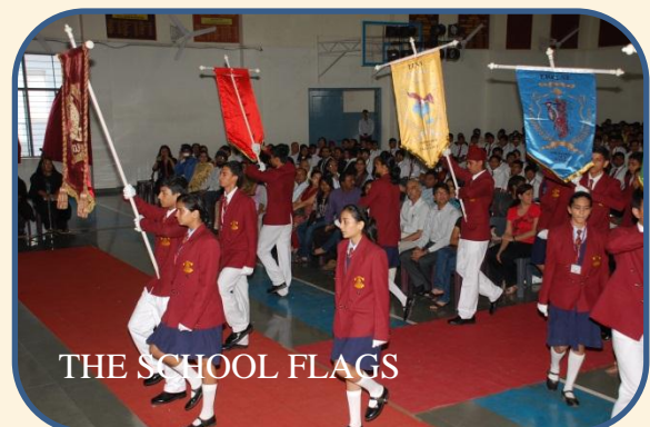
THE SCHOOL FLAGS