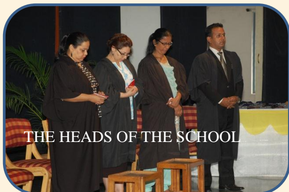
THE HEADS OF THE SCHOOL