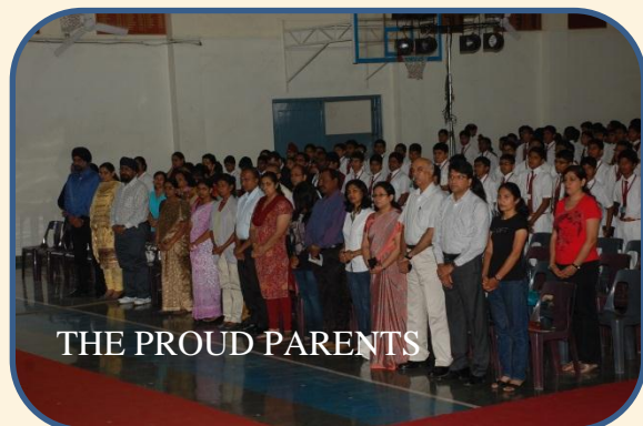
THE PROUD PARENTS