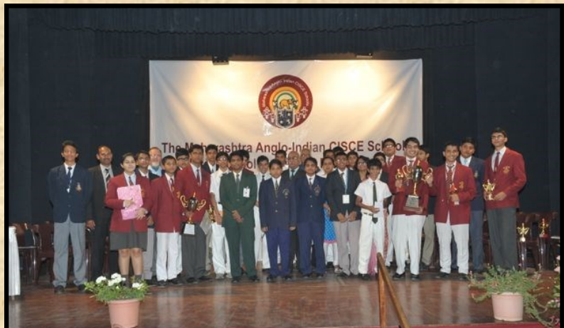
THE PARTICIPATING TEAMS