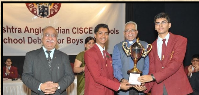
THE BISHOP'S CO-ED SCHOOL, KALYANI NAGAR THE UNDOUBTED CHAMPIONS