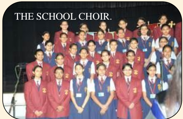
THE SCHOOL CHOIR.