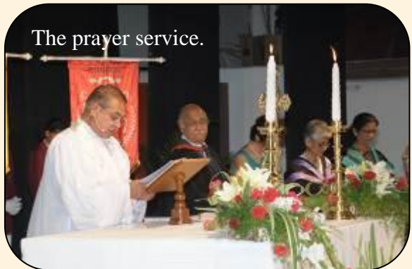
The prayer service.