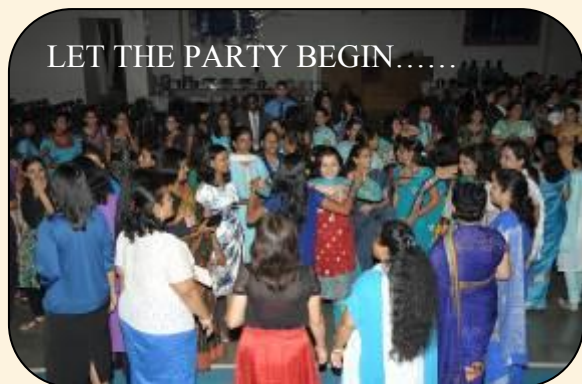
LET THE PARTY BEGIN.....