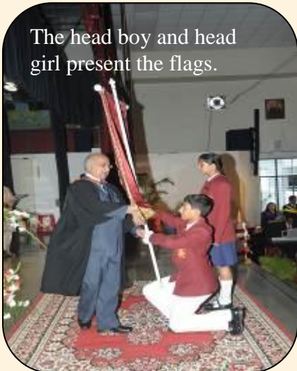
The head boy and head girl present the flags.