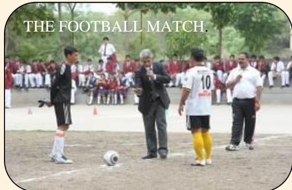
THE FOOTBALL MATCH.