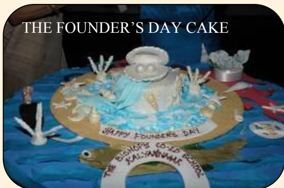
THE FOUNDER'S DAY CAKE