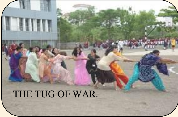
THE TUG OF WAR.