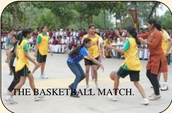
THE BASKETBALL MATCH.