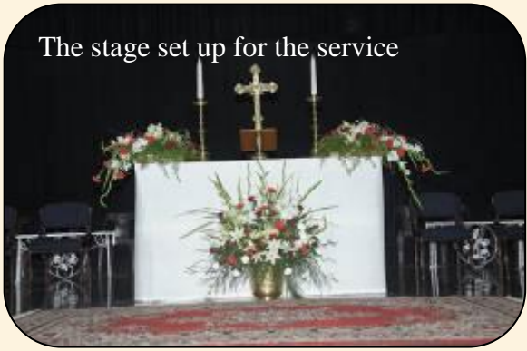
The stage set up for the service