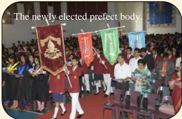
The newly elected prefect body.