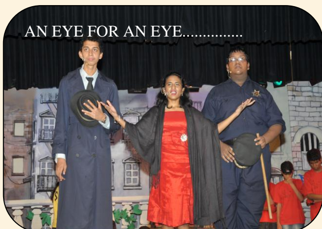
AN EYE FOR AN EYE.....