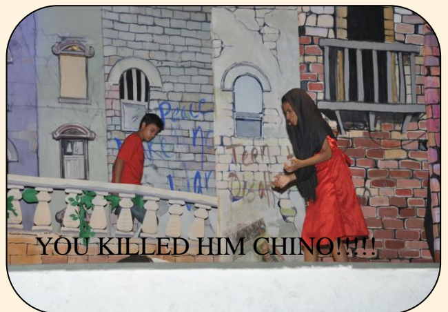
YOU KILLED HIM CHINO!!!!