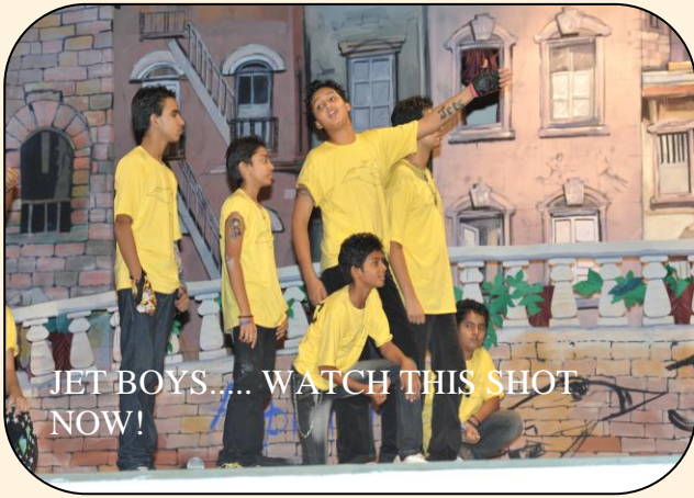
JET BOYS..... WATCH THIS SHOT NOW!