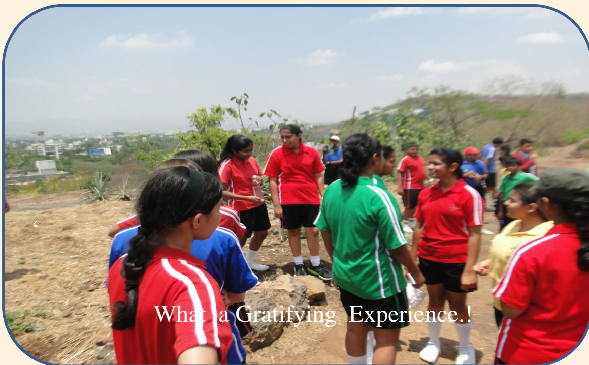
What a Gratifying Experience.!