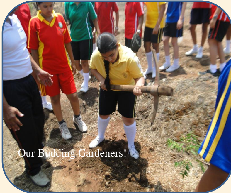
Our Budding Gardeners!